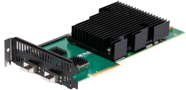
2-port Ethernet test module for emulating impairment at 5 speeds up to 100Gbps