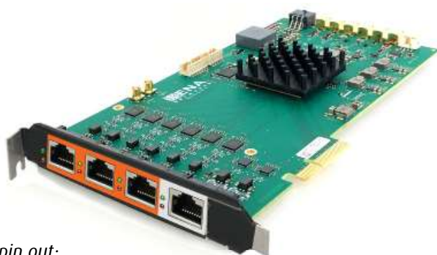
RJ45 connector pin out:

Both versions are available for Xena's 4U 12-slot ValkyrieBay chassis and our robust transportable 1U ValkyrieCompact chassis. They come complete with a full range of test software (as part of the Xena Value Pack*) which includes predefined test suites for RFC 2544, and comprehensive test automation options.